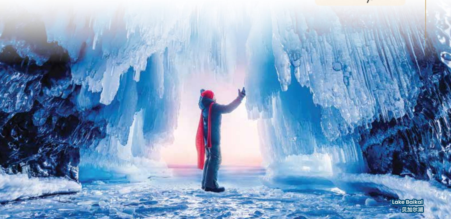
Lake Baikal 贝加尔湖