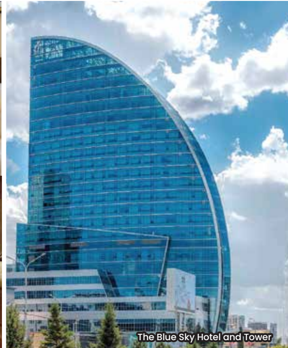
The Blue Sky Hotel and Tower