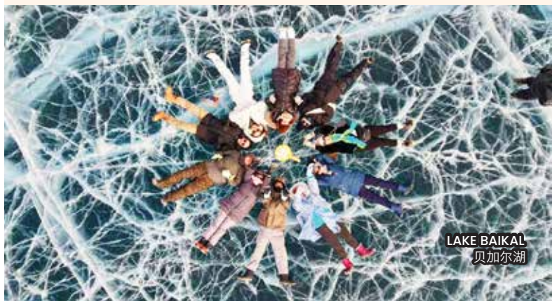
LAKE BAIKAL 贝加尔湖

行程次序以当地旅行社安排为准。行程，膳食，住宿，交通等可能会因不可抗拒因素而更动，恕不另行通知。