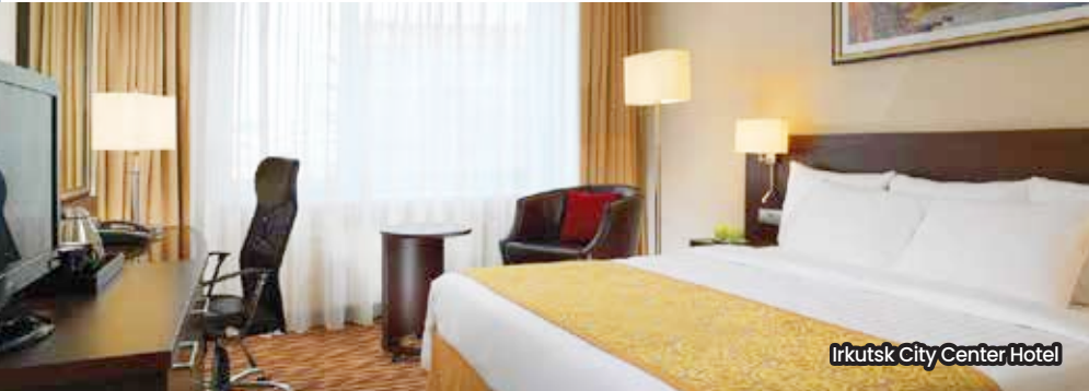
Irkutsk City Center Hotel

Embark on a complete journey at 4+5-star hotel, offering a quality & comfortable stay. 全程安排4+5星级酒店, 让您在整个旅程中享受到有质量且舒适的住宿环境。