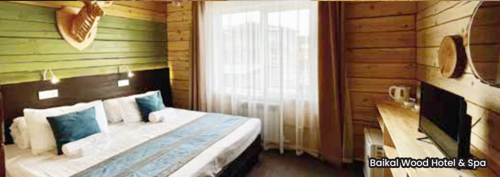
Baikal Wood Hotel & Spa