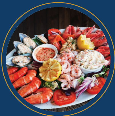
Seafood Platter 海鲜拼盘