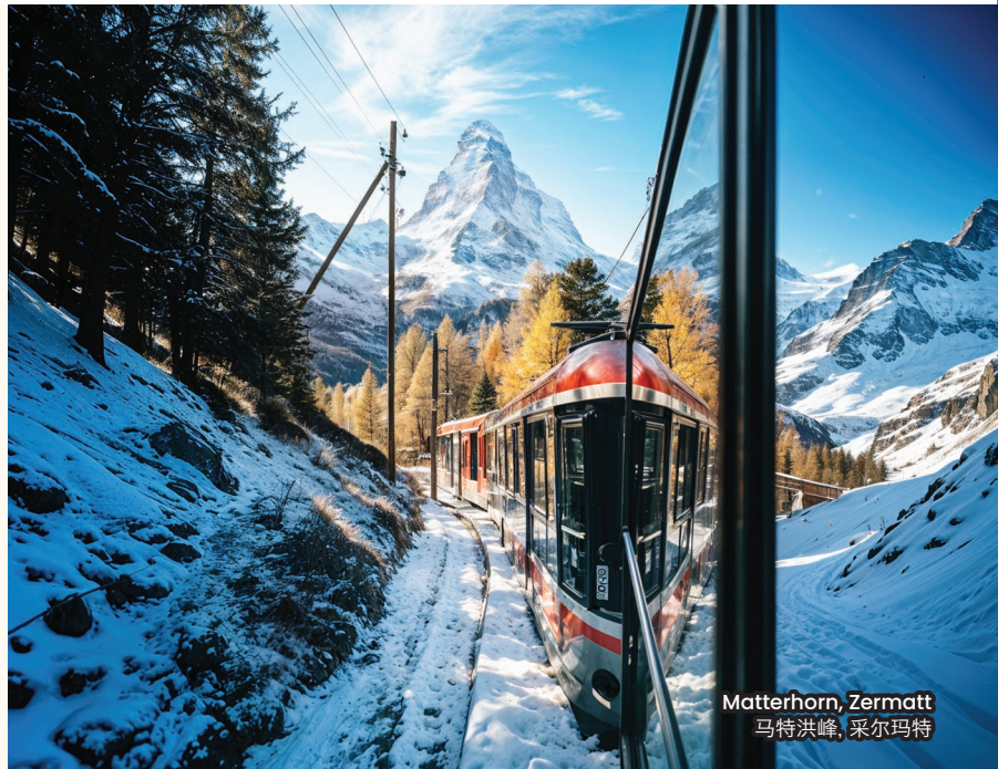
Matterhorn, Zermatt 马特洪峰, 采尔玛特