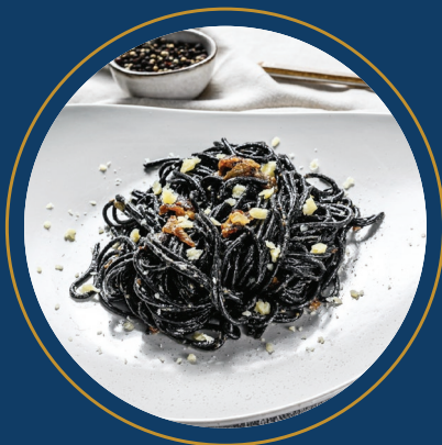
Squid Ink Spaghetti 墨鱼汁意大利面