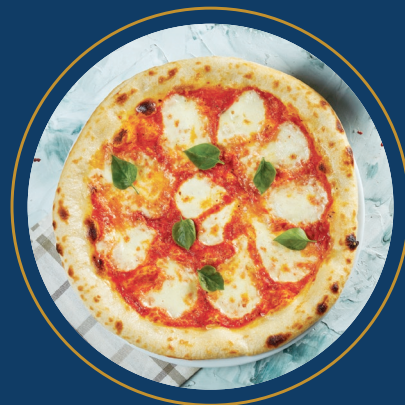
Pizza Margherita 玛格丽塔比萨