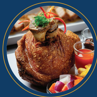
Austria Pork Knuckle 奧地利豬肘