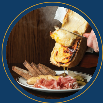
Raclette Cheese 瑞士特色烤奶酪